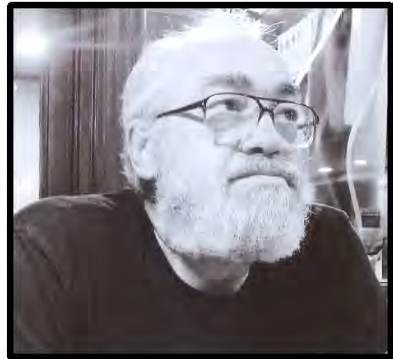
Dedicated in Memory of Randy Derum